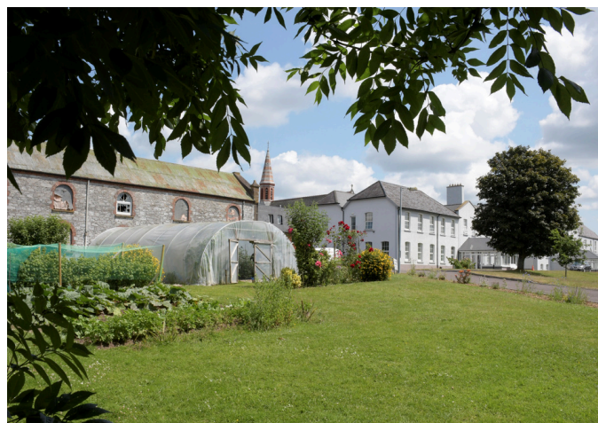
Fr Tom's garden on the grounds of the SMA House, Wilton