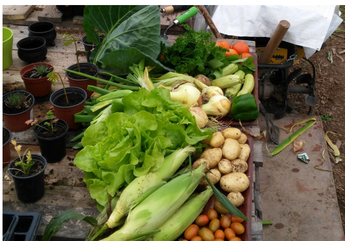
A selection of vegetables freshly picked from Fr. Tom's garden