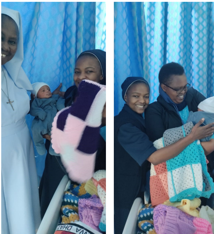
Two pictures showcasing the work of our parish group "Knitting for Africa." The group meet in the parish centre, Mondays at 2 pm to knit baby clothes and blankets for children in Africa. The clothes are then shipped off to Africa where we can see in the above pictures, they are highly appreciated.

Fr. Tim Cullinane SMA has just published a new book "The story of St Therese of Lisieux (The Little Flower). The book is on sale in the Mass Office. €5 a copy.